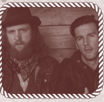
Brothers Osborne Saturday - February 14