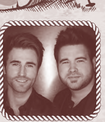
The Swon Brothers Tuesday - February 17