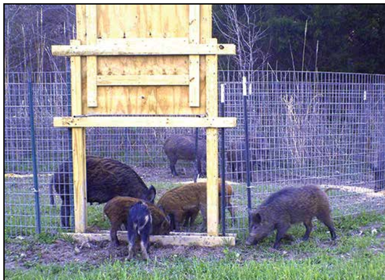
Wild hogs explore the ground for food inside and near a corral-type trap, which is considered one of the best methods for removing large numbers of the land- and crop-damaging pests.

It may be best to wait until deer season has closed to minimize activ-