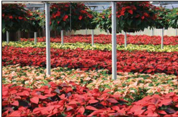
Rows of red, green and multicolored poinsettias are lined up in rows in a greenhouse, with pots of poinsettias hanging from the bars overhead.

The range of available poinsettia colors is truly remarkable. Poinsettia is no longer just that red Christmas plant. We can purchase them in white, pink, maroon, speckled and marbled selections. This year, I noticed a resurgence in plants painted and dyed in totally nontraditional