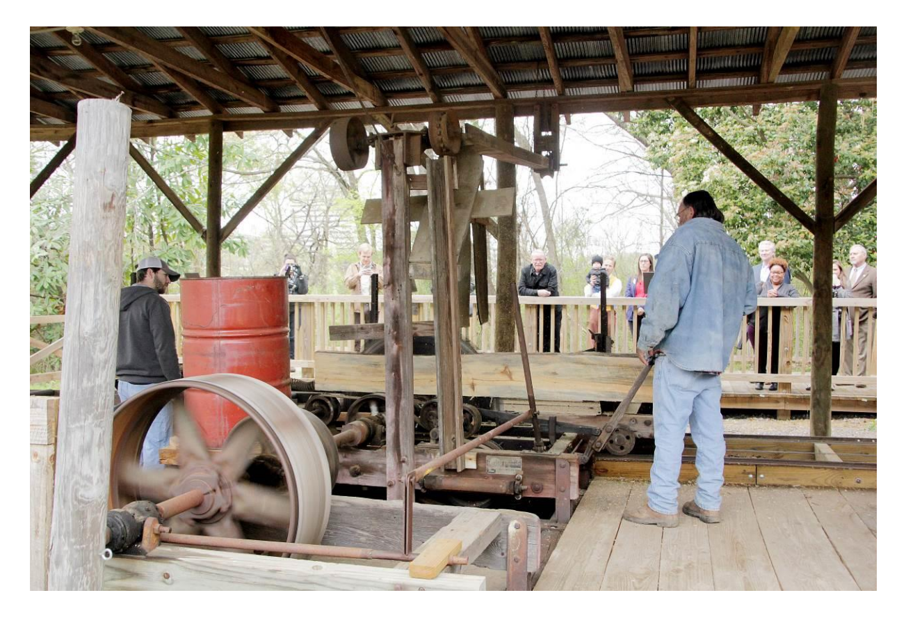
Sawmill program attendees watch as Mississippi Agriculture and Forestry Museum volunteers operated the Small Town Sawmill at the museum's ribbon cutting Thursday.